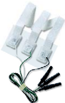
EP30018 Limb Band