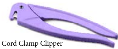
Cord Clamp Clipper