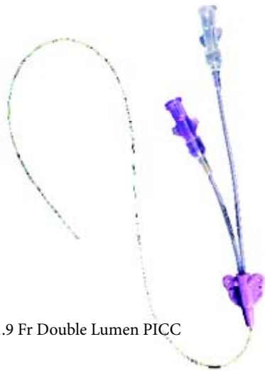
1.9 Fr Double Lumen PICC