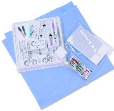
Argyle UVC Insertion Tray