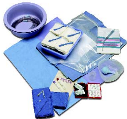
C-Section Deluxe Kit