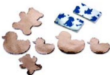
Temperature Probe Covers