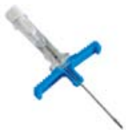
Peel Away Cannula Introducer