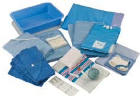
Vaginal Deluxe Delivery Kit