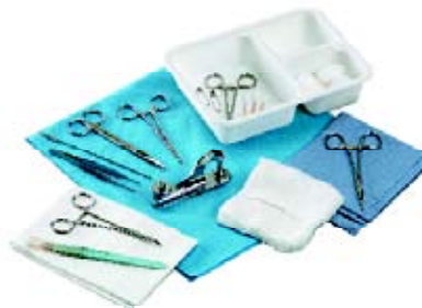
Tray with clamp