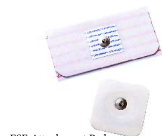
FSE Attachment Pads