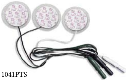
1041PTS Radiolucent Wires