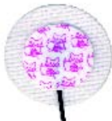
1051NPSM Radiolucent wire