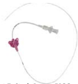
1.9 Fr Single Lumen PICC