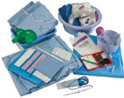
C-Section Delivery Kit with ES Pencil