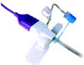
Fluid Resistant Connector