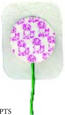
1042PTS Radiolucent Wires