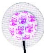
1051NPSM Radiolucent wire