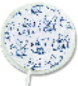
1050NPSM Non-radiolucent wire