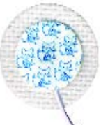
1052NPSM Non-radiolucent wire