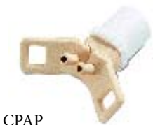
CPAP Nasal Cannula